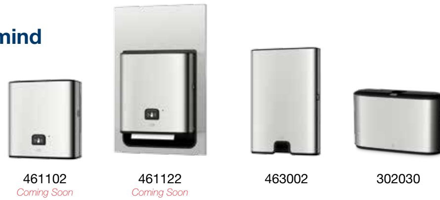
461102 Coming Soon 461122 Coming Soon 463002 302030

There is a moment of truth when the guest reaches out for a paper towel. What they find next can make or break their impression of your establishment. This is why Tork has a wide range of refills allowing you to create the washroom experience your guests deserve.